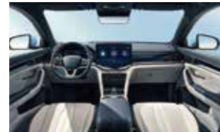
Blue and grey